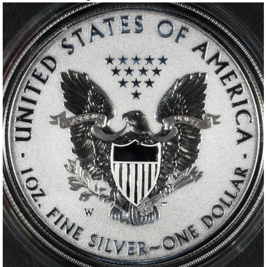
American silver Eagle Enhanced Reverse Proof – Reverse