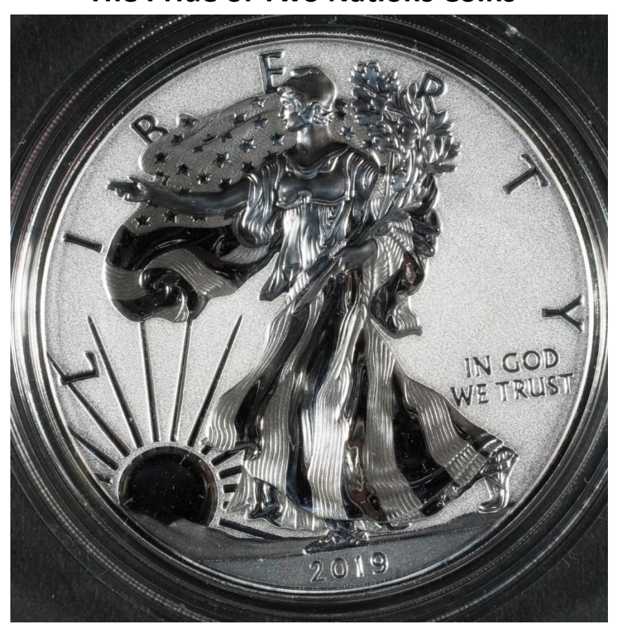
American silver Eagle Enhanced Reverse Proof - Obverse