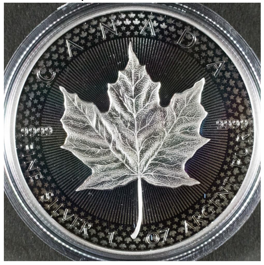
Canadian Maple Leaf Enhanced Proof - Reverse