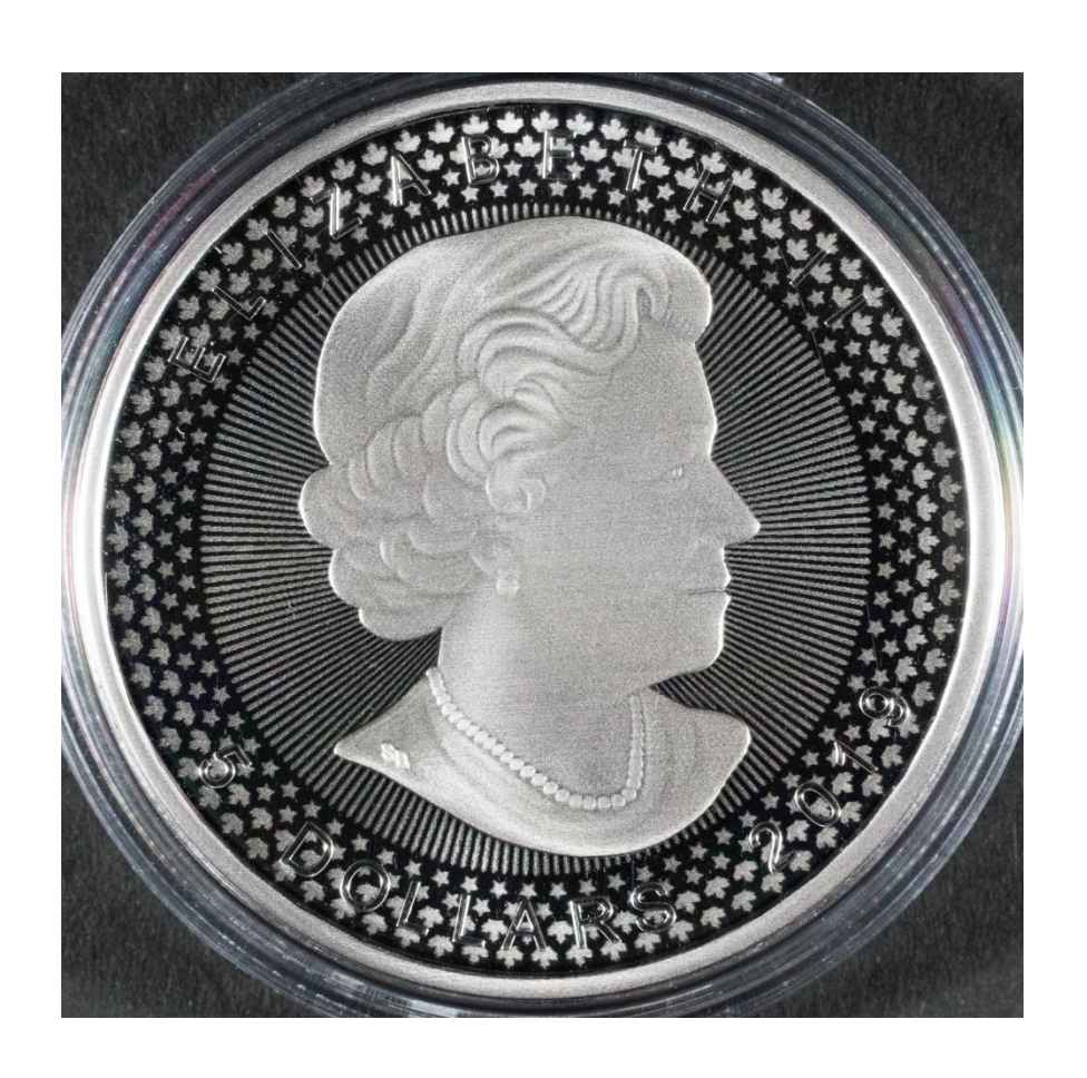
Canadian Maple Leaf Enhanced Proof - Obverse